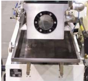
Pan Covers Length of the Tank for Maximum Coverage