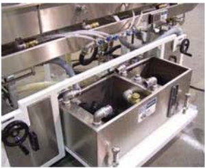
Retractable Water Reservoirs for Easy Cleaning Access